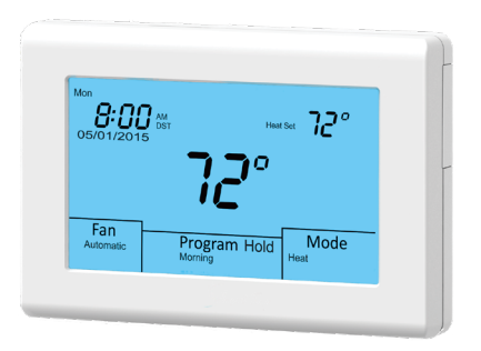
UT32 thermostat sold separately