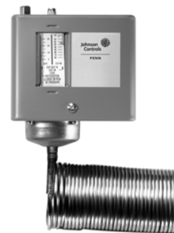
A70GA-1 Temperature Control