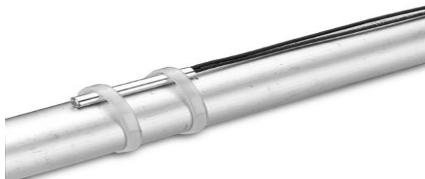
Figure 1. Surface Mounted Pipe Sensor.