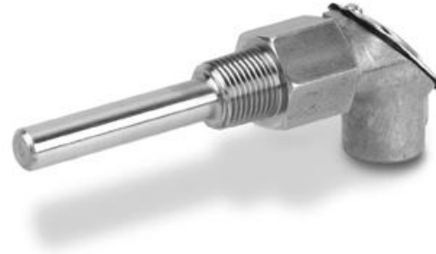
Figure 6. Liquid Immersion Temperature Sensor.