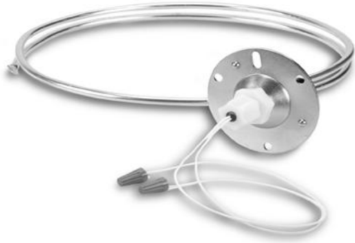
Figure 5. Averaging Flexible Temperature Sensor.