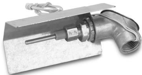
Figure 2. Outside Air Temperature Sensor.